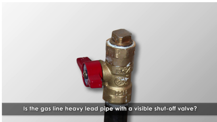
Is the gas line heavy lead pipe with a visible shut-off valve?