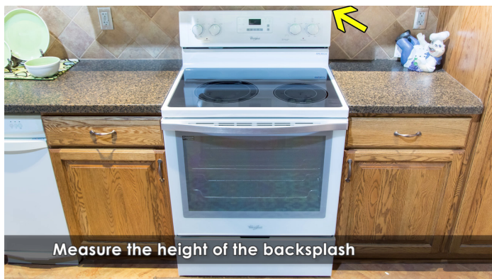
Measure the height of the backsplash

How many prongs does your 220v outlet have?