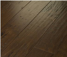
941 Three Rivers