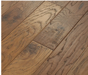
2000 Pacific Crest