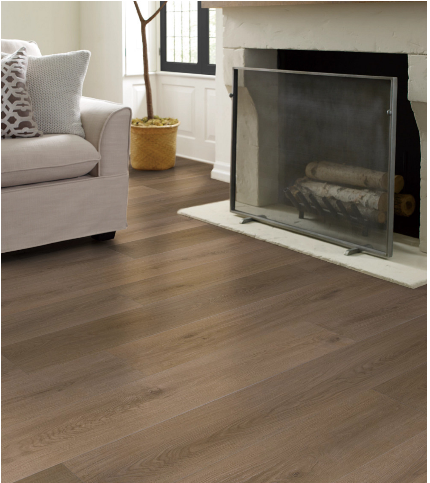
7324 Bark Chocolate