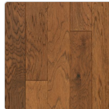
Golden Hickory 93