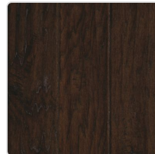
Espresso Hickory 96