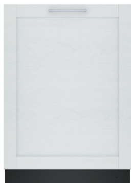
SHV53CM3N Custom Panel

The 3rd rack provides the perfect space for silverware and large utensils while its V shape leaves room below for taller items.