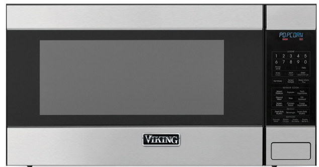
30" Wide Conventional Microwave Oven