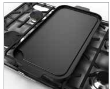
Optional Griddle Accessory