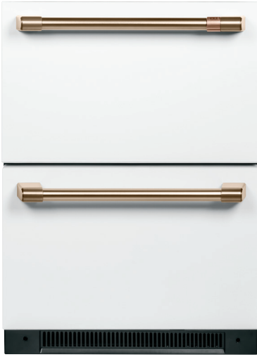
CDE06RP4NW2 Matte White with Brushed Bronze handles