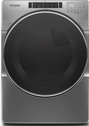
Chrome Shadow WGD8620HC