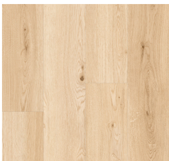
Santa Cruz Sand

Dive into the Mavericks collection, where the durability of waterproof flooring meets epic hardwood realism. Presenting CALI's longest planks ever, this luxury laminate collection draws inspiration from the rugged Northern California coastline and legendary surf spot known for its massive waves. Mavericks floors embody the strength and beauty of the natural world with extra scratch resistance, authentic knots and grains, and matte surfacing designed to capture the understated charm of actual oak. Planks are backed by attached acoustic padding, for added sound insulation and better comfort underfoot – creating spaces that are as peaceful as they are beautiful.