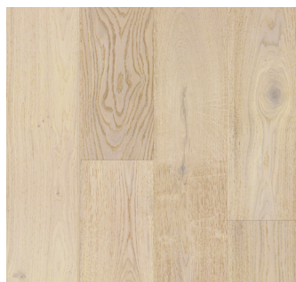
Half Moon Oak