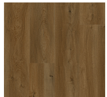
Mocha Del Mar