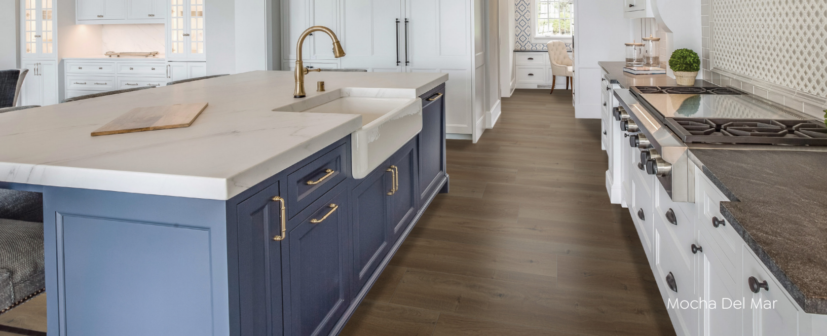
Mocha Del Mar