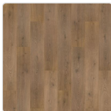
Dockside Oak 852