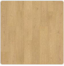
Golden Hour Oak 122