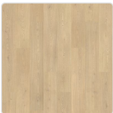
Sunbleached Oak 831