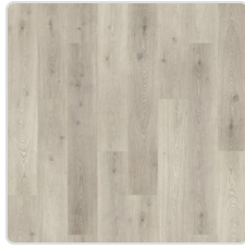
Sunshower Oak 935