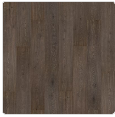
Anchor Oak 988