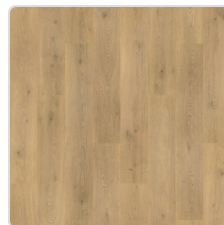
Tulip Shell Oak 248