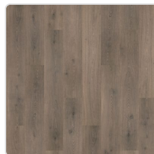
Cloudy Oak 958