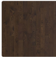
Umber Oak 889