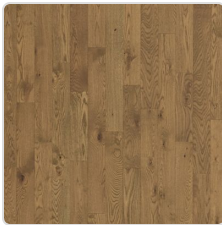
Davenport Tan Oak 838