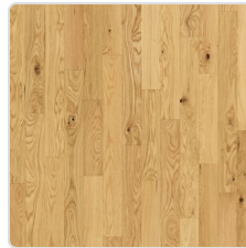
Natural Oak 131