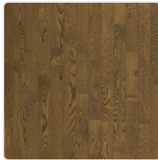
Urban Bronze Oak 851