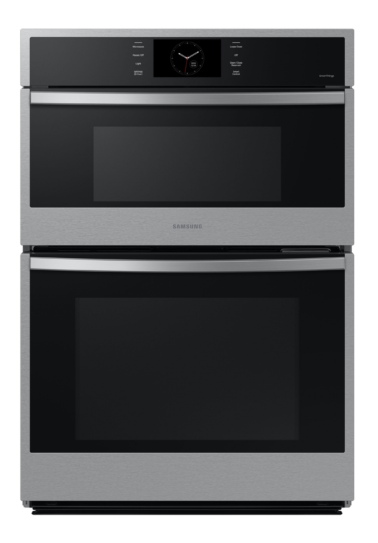
Matte Black Steel NQ70CG600DMT