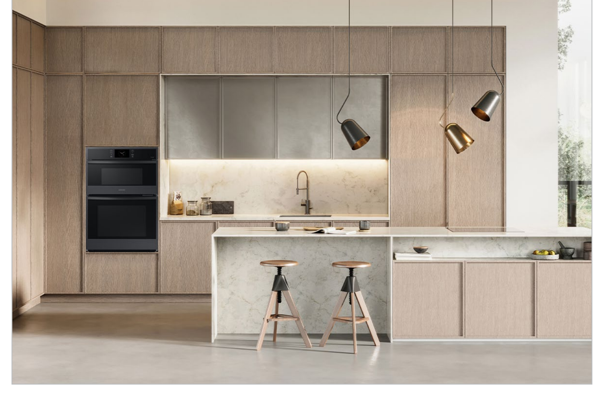
Stainless Steel Matte Black Steel

Oven: Overview | Messaging | Specs | Icons Samsung proprietary and confidential