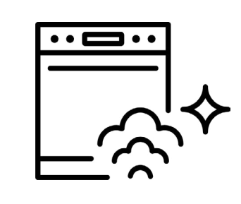
Self + Steam Clean