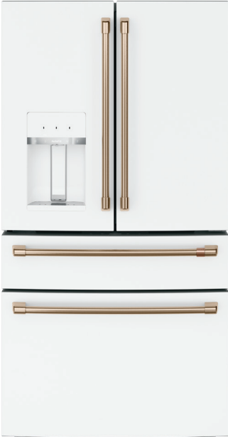
CXE22DP4PW2 Matte White with Brushed Bronze handles