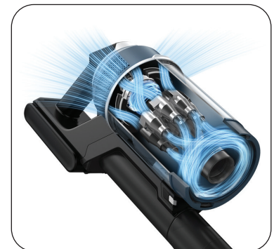
Advanced Cleaning Performance