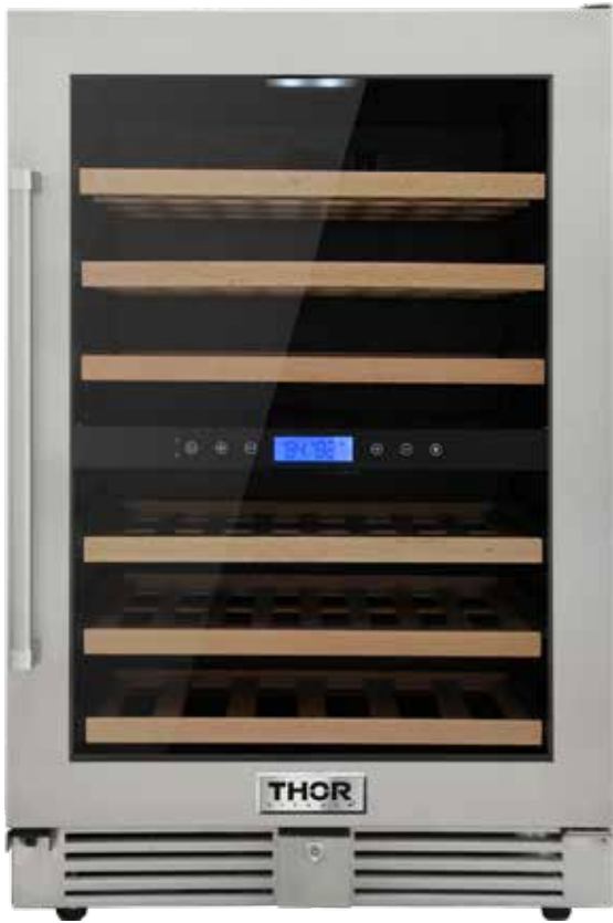
Product: 24 Inch Dual Zone Indoor/Outdoor Wine Cooler