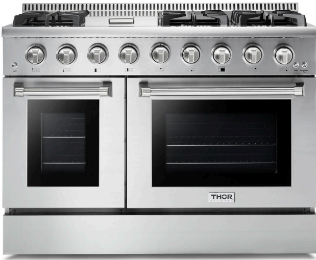
Product: 48 Inch Professional 6 Burner Gas Range in Stainless Steel Model Number: HRG4808U / HRG4808ULP