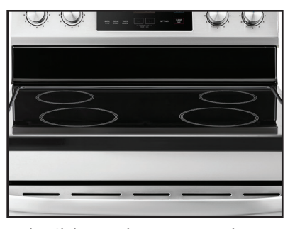
Flexible 4-element cooktop