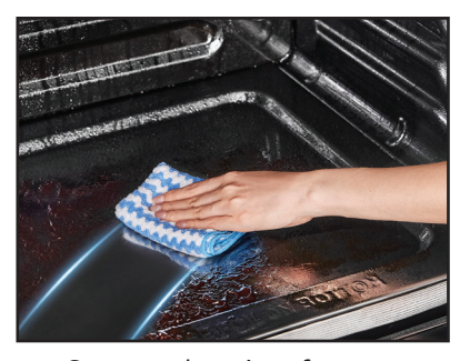
Steam cleaning feature