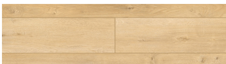
LI-ID13 Woodland Charm