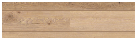
LI-ID14 Homewood Waltz