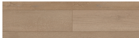
LI-ID11 Tannin Honey