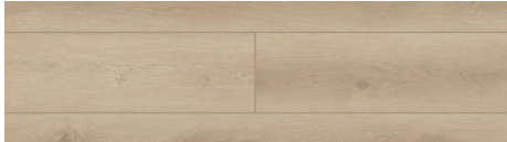
LI-ID04 Pearl Abyss