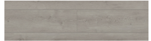
LI-ID03 Slate Ballad