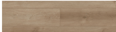
LI-ID08 Peacock Flush