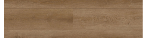
LI-ID06 Fortress Dawn