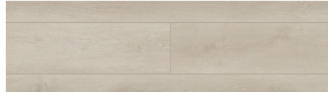
LI-ID05 Ashen Land