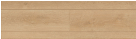
LI-ID01 Country Breeze