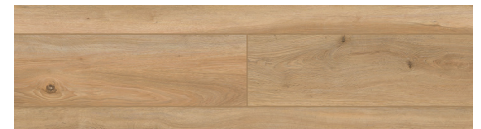
LI-ID12 Shoreline Décor