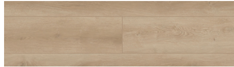
LI-ID02 Castle Forge