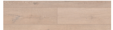
LI-ID09 Lotus Clove