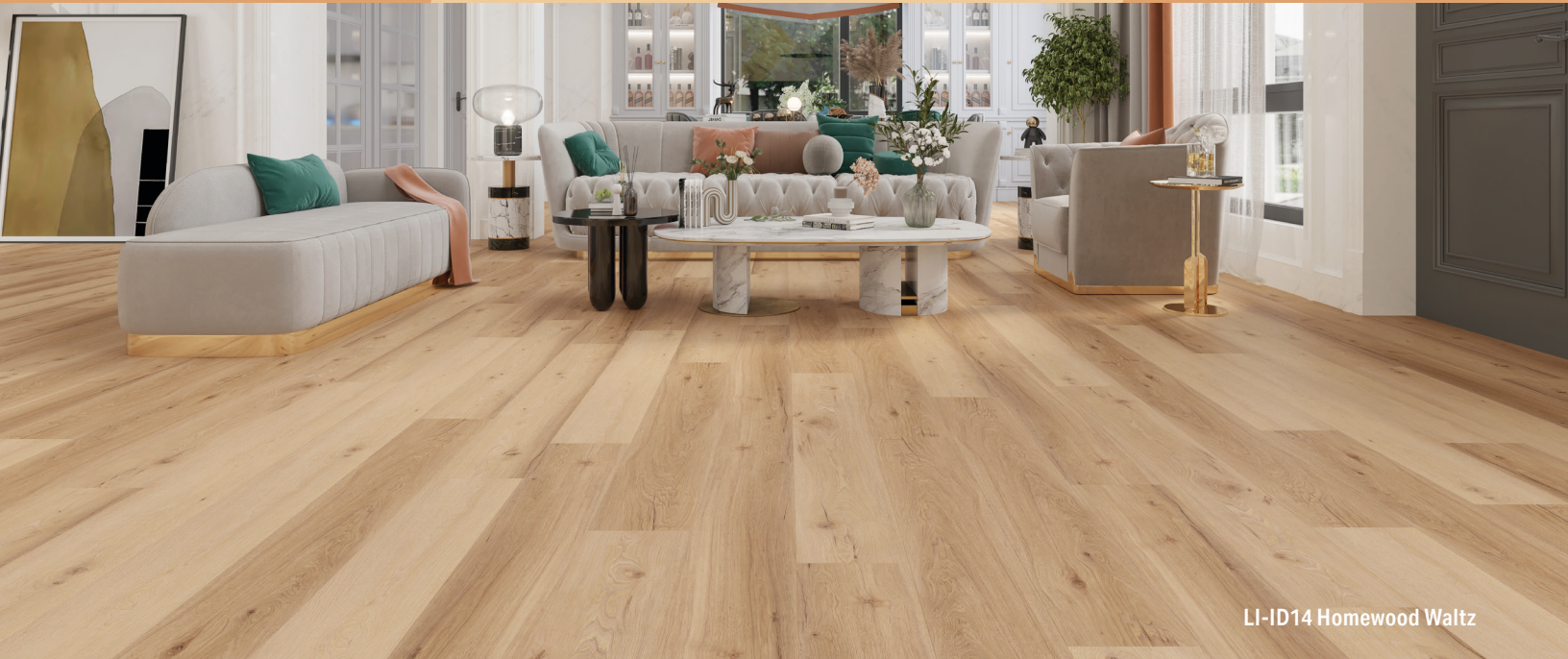
LI-ID14 Homewood Waltz

Indoor Delight offers sophisticated European oak designs using the latest EIR embossing technology, 10 plank repeats, and on-trend 6' x 9" planks, delivering a premium, rich and vivid look. Its exclusive designs are unique to Lions Floor, ensuring truly "limited edition" flooring projects that protect consumers from competitors. Indoor Delight is also antibacterial-cured, easy to install, low-maintenance, environmentally friendly, and durable, making it appeal to both homeowners looking for an upgrade on their remodel, as well as builders in mid to high-end new construction.