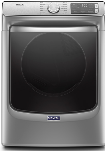
Chrome Shadow MED8630HC