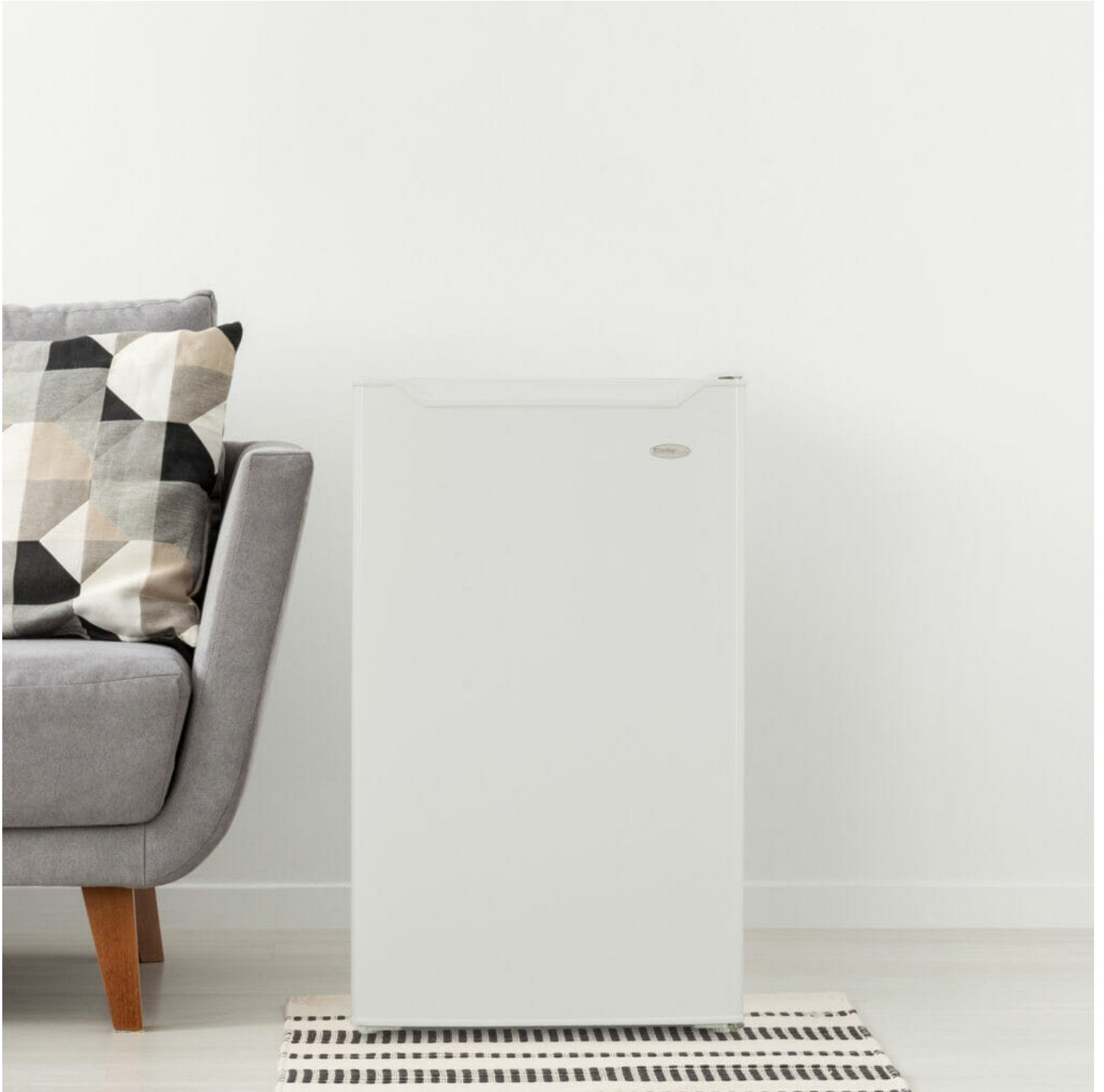
Smooth Back Design