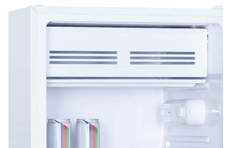
Full width chiller section