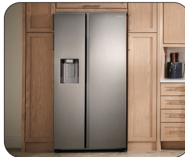
Built-in Look with Counter Depth

Fingerprint Resistant Black Stainless Steel