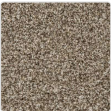
Quiet Neutral 859