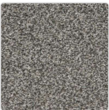
Steel Summit 949