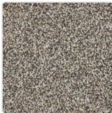
Mineral Walk 952