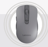
Lenovo WL310 Bluetooth Silent Mouse