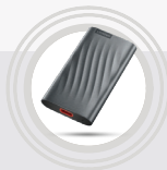
Lenovo PS6 Portable SSD