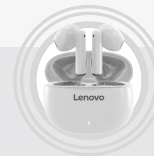
Lenovo E310 True Wireless Stereo Earbuds