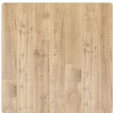
Maple Sapling 449