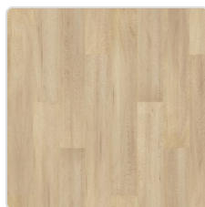
Dusty Trail Oak 469