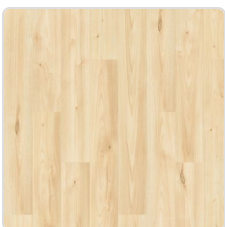
Sand Chestnut 423