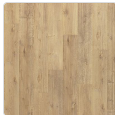
Fallen Leaf Oak 468