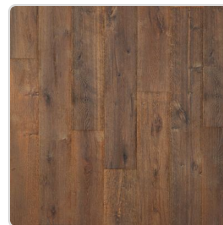
Mountain Ridge Oak 361