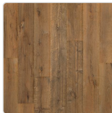
Nature Walk Oak 258