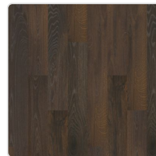
Forest Brown Oak 368