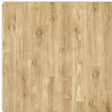
Sailor's Rope Oak 01