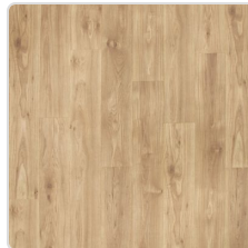
Nantucket Beige Oak 02