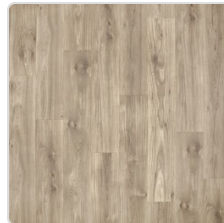
Polished Grey Oak 04