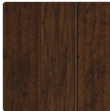
Coffee Hickory 94