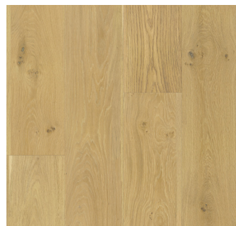
Deep Sand Sea