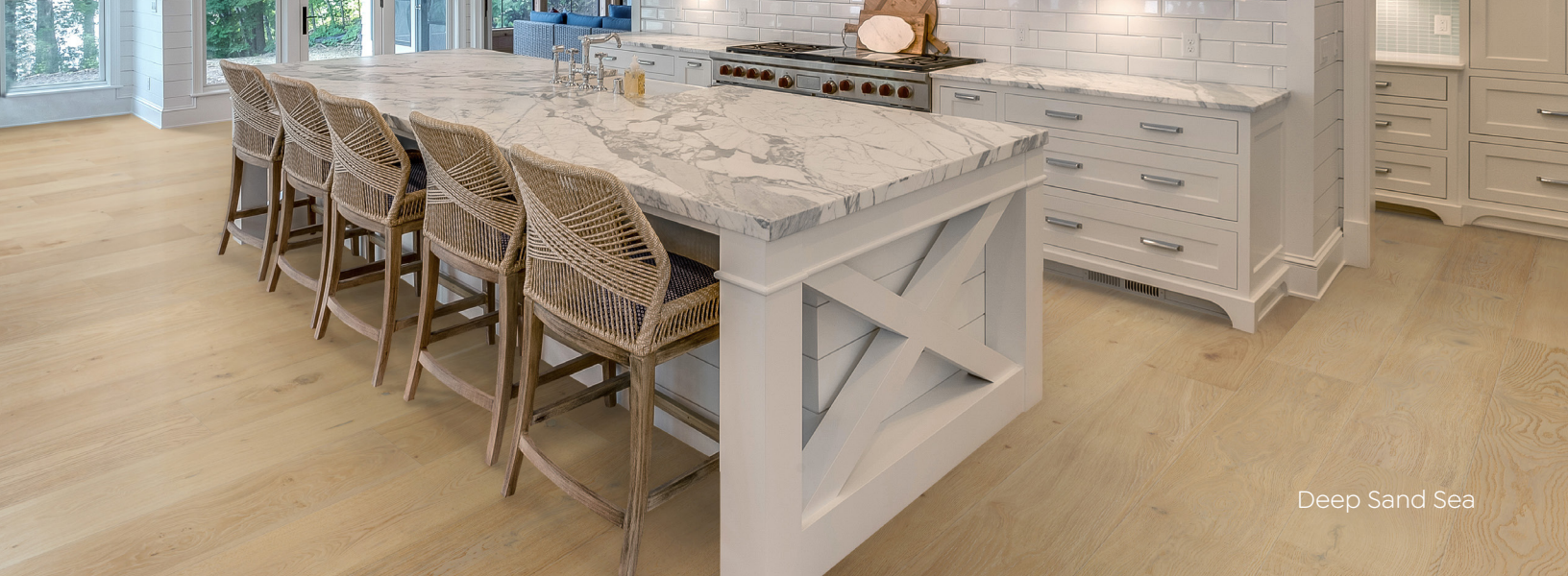
Deep Sand Sea