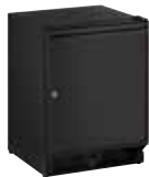
BLACK SOLID (LOCK)