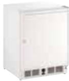
WHITE SOLID (LOCK)