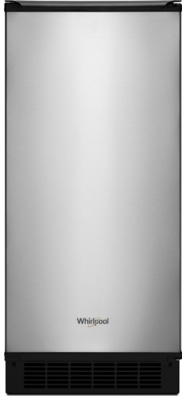
Fingerprint-Resistant Stainless WUI75X15HZ