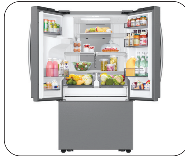
Mega 31 cu. ft. Capacity