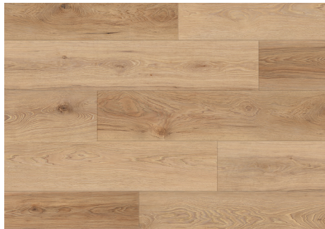
LI-DM05 Overland Park