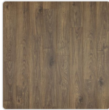
Cottonwood Oak 03