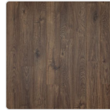
Rustic Forest Oak 05