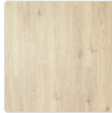
Iris Oak 02