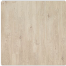
Nimbus Oak 01