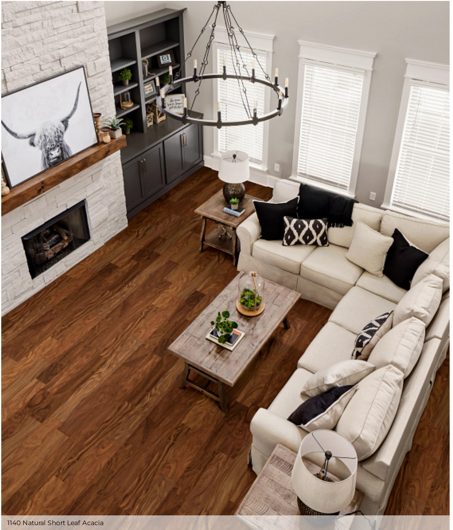
1140 Natural Short Leaf Acacia