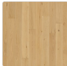
Aged Linen Oak 137