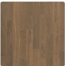
Wild Truffle Oak 868