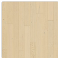
Stone Washed Oak 127