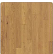
Timeless Oak 842