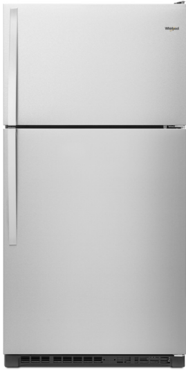
Fingerprint-Resistant Stainless WRT311FZDZ