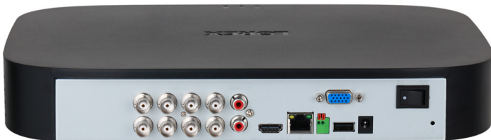
8 Channel Model