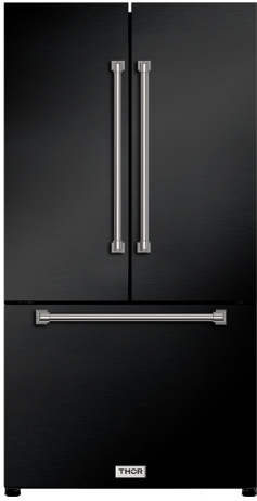
STAINLESS STEEL RF3621CTD00-SS