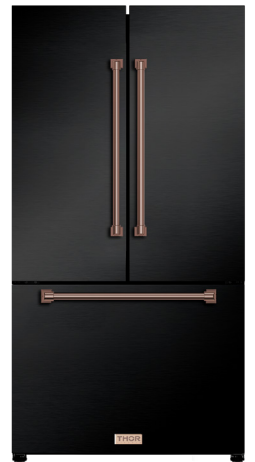
ROSE GOLD RF3621CTD00-RSG