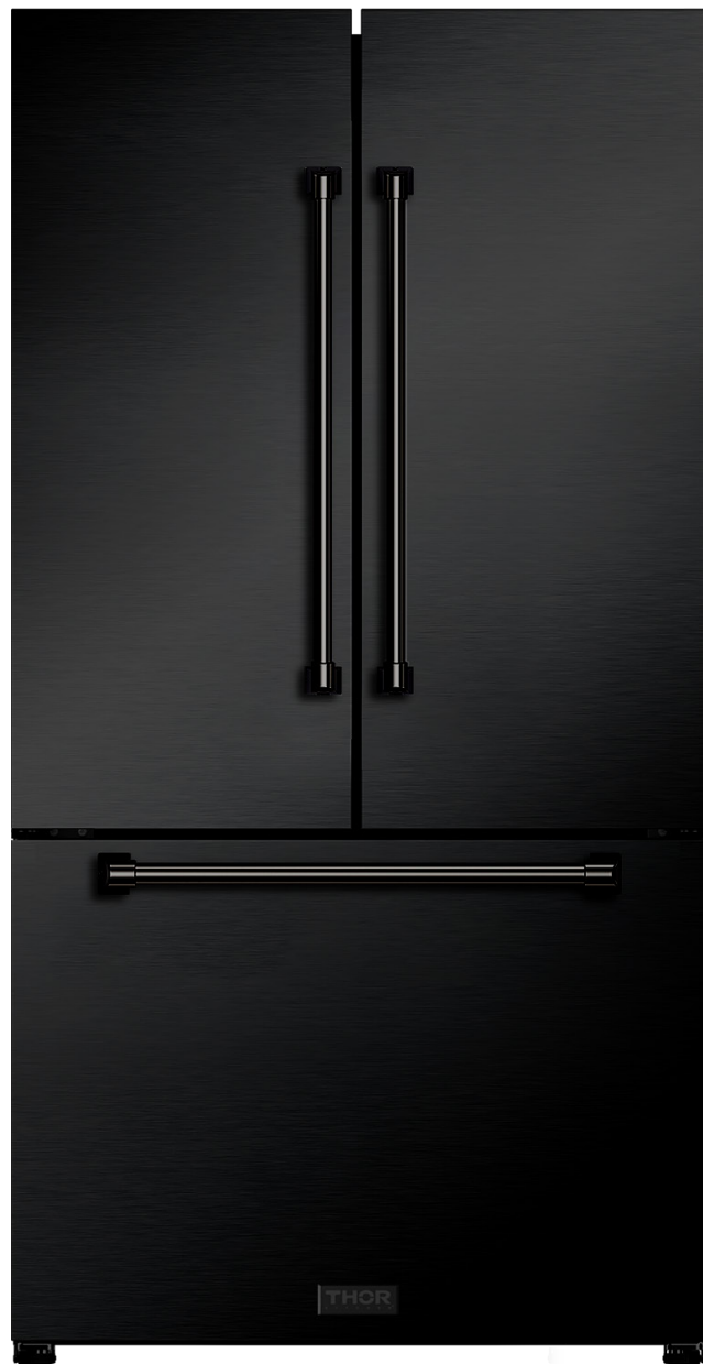
Product: Gordon Ramsay by THOR Kitchen 36 Inch 20.3 Cu Ft French Door Counter Depth Refrigerator With Ice Maker In Matte Black Model Number: RF3621CTD00