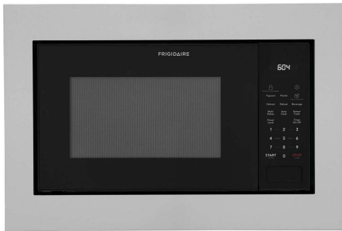
Install Trim Kit Required. Multiple finishes and sizes available.