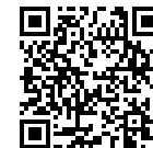
Scan Here for additional accessories and replacement parts.

*Accessories not included with purchase.