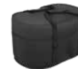
Ninja® Travel Bag